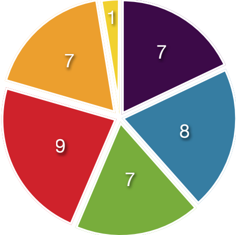
Figure 32: Municipal agencies, Number of APRA response time violations