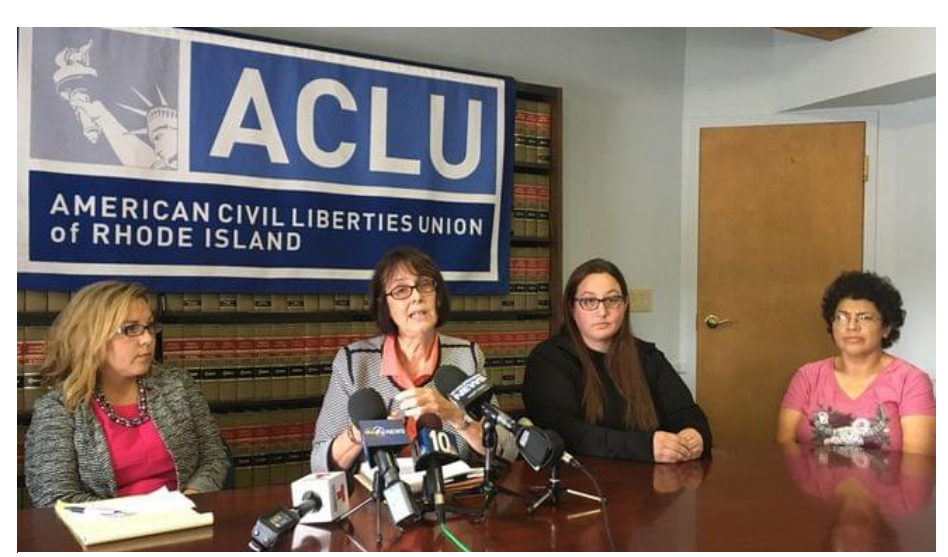
J.Y. V. PROVIDENCE SCHOOL DEPARTMENT NEWS CONFERENCE

128 Dorrance Street, Suite 400 Providence, RI 02903 (401) 831-7171 www.riaclu.org