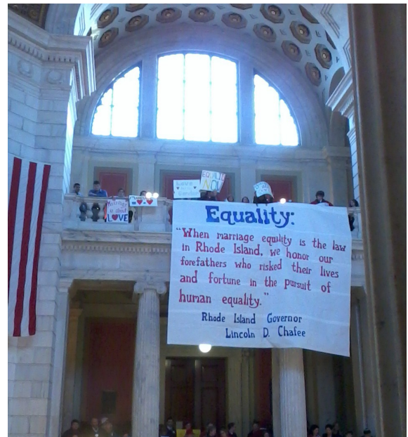
Activists flooded the State House on February 9th to promote same-sex marriage legislation heard in House Judiciary Committee that day. The hearing lasted until 1:30 in the morning.