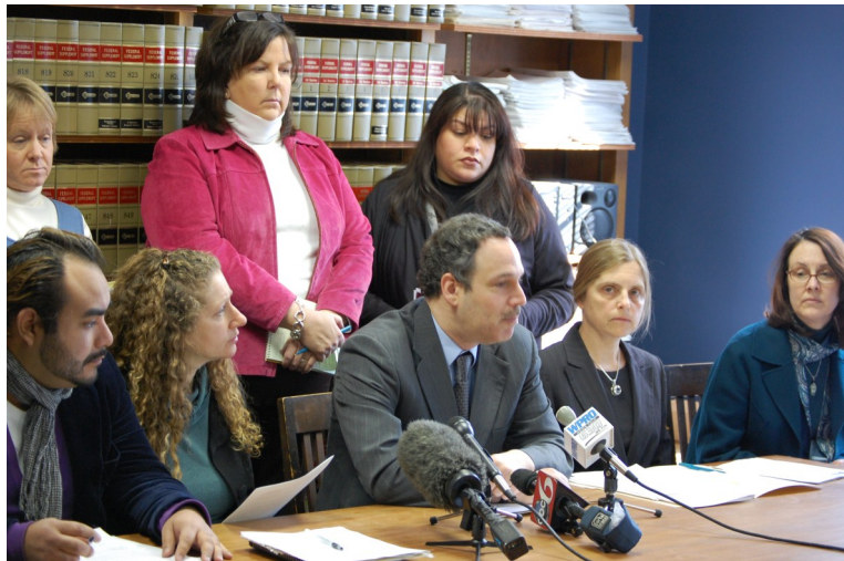
Community groups participated in a well-attended news conference to explain the impact of high stakes graduation requirements on at-risk students.

On the eve of a final public hearing on proposed new high stakes testing school graduation requirements for students in Rhode Island, a diverse group of organizations highlighted startling statistics that document the devastating impact that the proposed requirements would have on at-risk students in the state. The groups – the RI ACLU, RI Disability Law Center, the Autism Project of RI, RI Legal Services, Urban League of RI, Progreso Latino, Parent Support Network of RI, the Center for Hispanic Policy and Advocacy, Young Voices and the George Wiley Center – assert that the policy would essentially institutionalize a caste system in Rhode Island’s public schools.